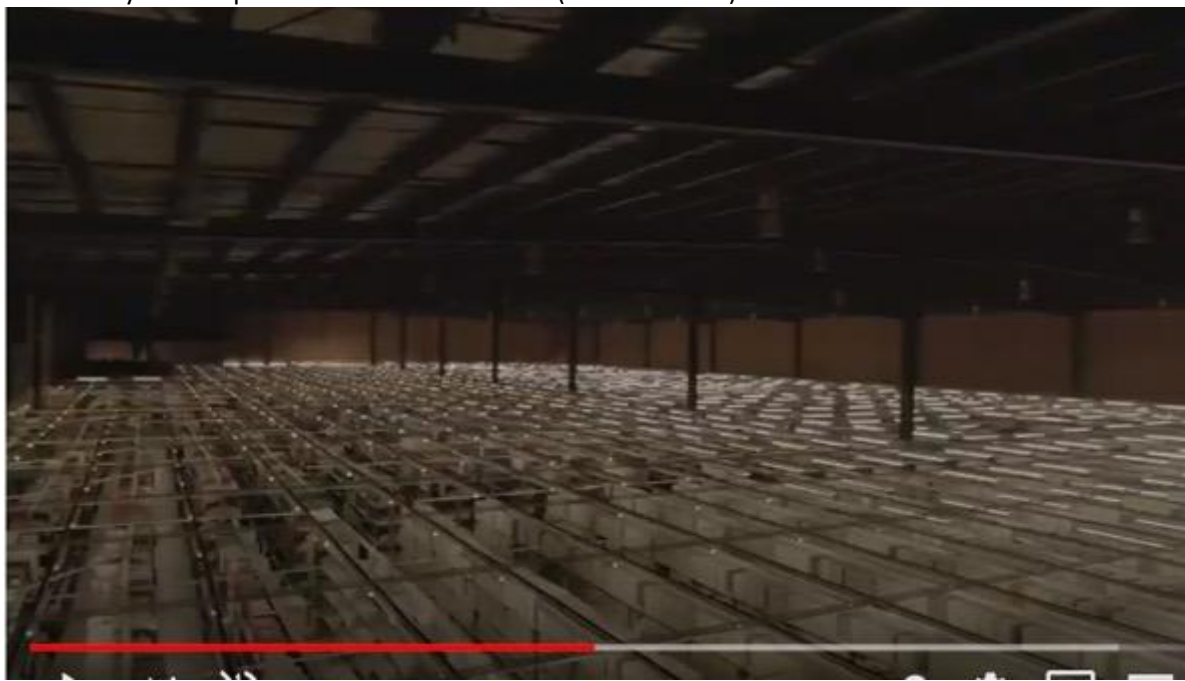
Hume Print repository part of the collection—video is here <a href="https://www.youtube.com/watch?v=WTtJvIP8dfs">https://www.youtube.com/watch?v=WTtJvIP8dfs</a>

A summary of the spaces and risks is attached (Attachment 1)