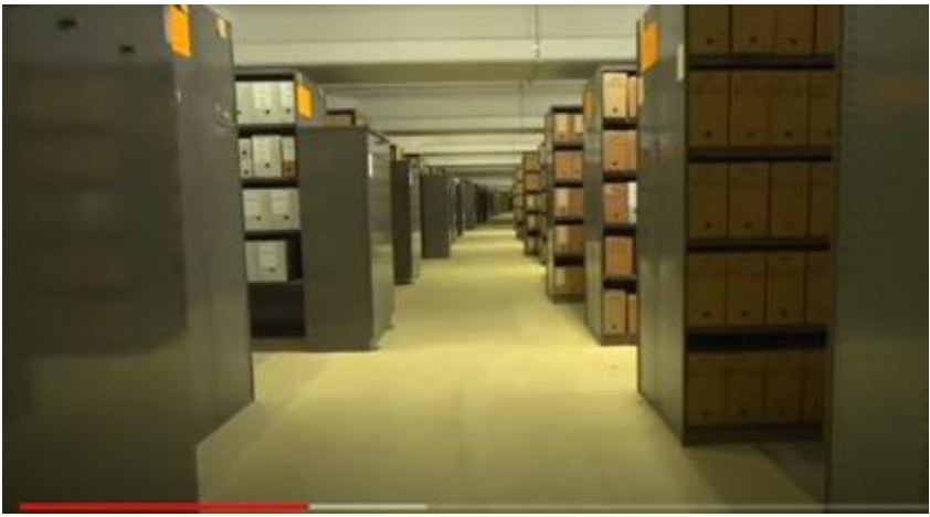
Underhill storage – video is here <a href="https://www.youtube.com/watch?v=qSt24hNwDos&t=18s">https://www.youtube.com/watch?v=qSt24hNwDos&t=18s</a>