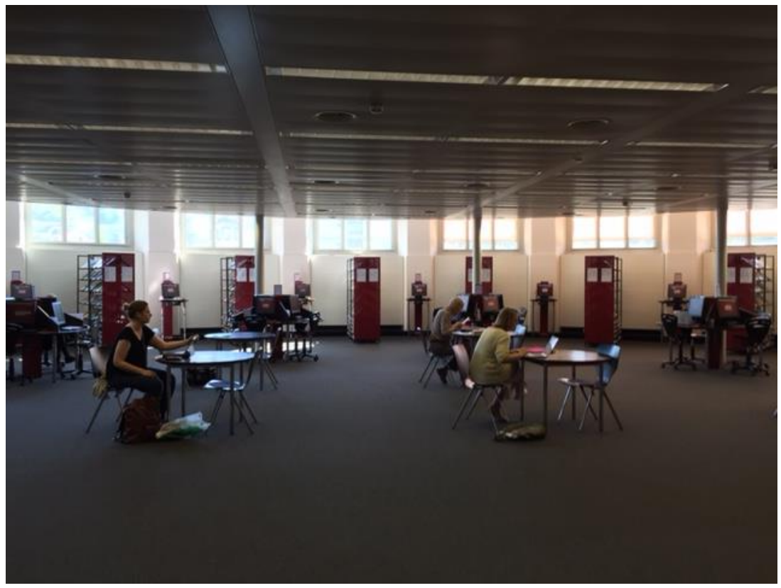
Main reading room, bottom level (note it is directly under the Cupola in the main building)

There is a special collection reading room which provides access to original and historic material