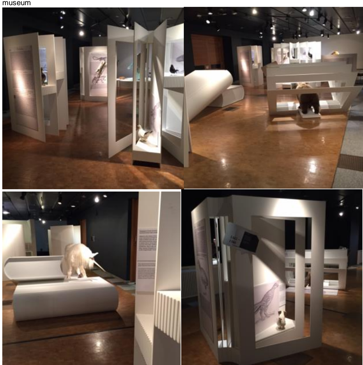
Attachment. Images showing interesting use of printed material and display at the University of Zurich museum