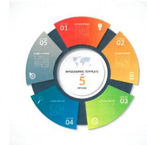
Figure 1-1 Expected income in 2019

Video provides a powerful way to help you prove your point. When you click Online Video, you can paste in the embed code for the video you want to add. You can also type a keyword to search online for the video that best fits your document. To make your document look professionally produced, Word provides header, footer, cover page, and text box designs that complement each other. For example, you can add a matching cover page, header, and sidebar. Click Insert and then choose the elements you want from the different galleries.