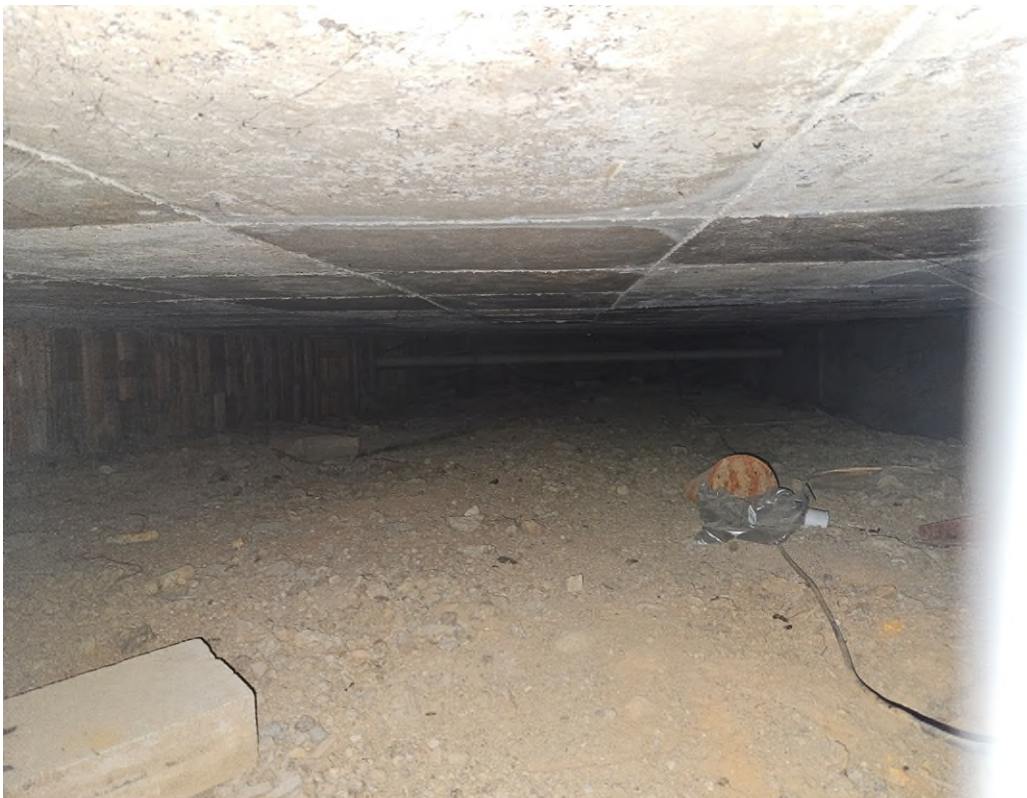
Figure 2: Crawl Space under building

Accessing these spaces is considered to be a confined space due to the restricted means of entry and potential change in atmospheric conditions (gases) will require confined space entry procedures to ensure worker safety.