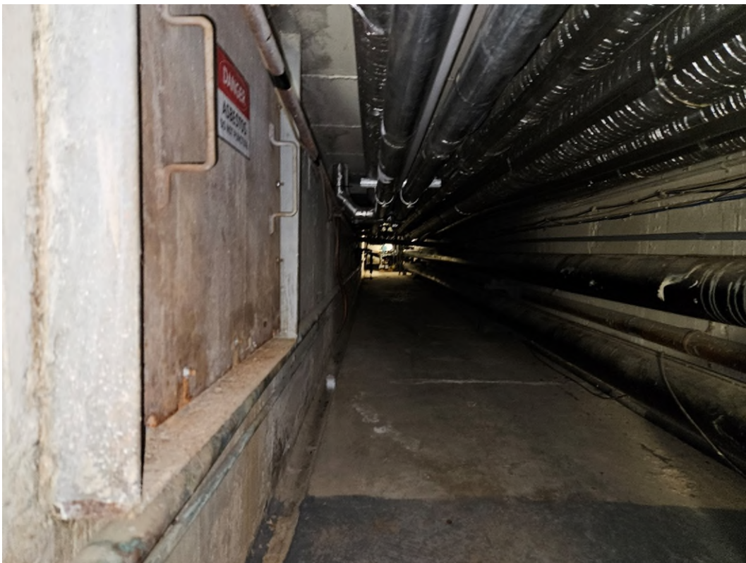
Figure 4: Access to crawl space via tunnel