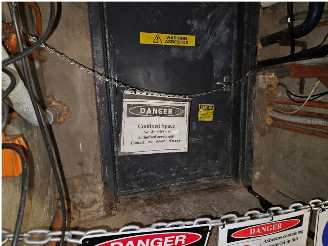
Figure 5: Access to crawl space via tunnel