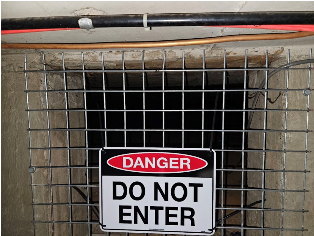
Figure 3: Access to crawl space