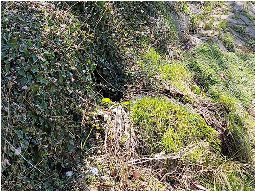
Figure 4: Stormwater access – along creek bank