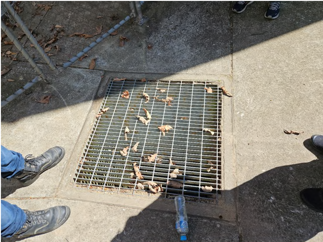
Figure 6: Stormwater Access