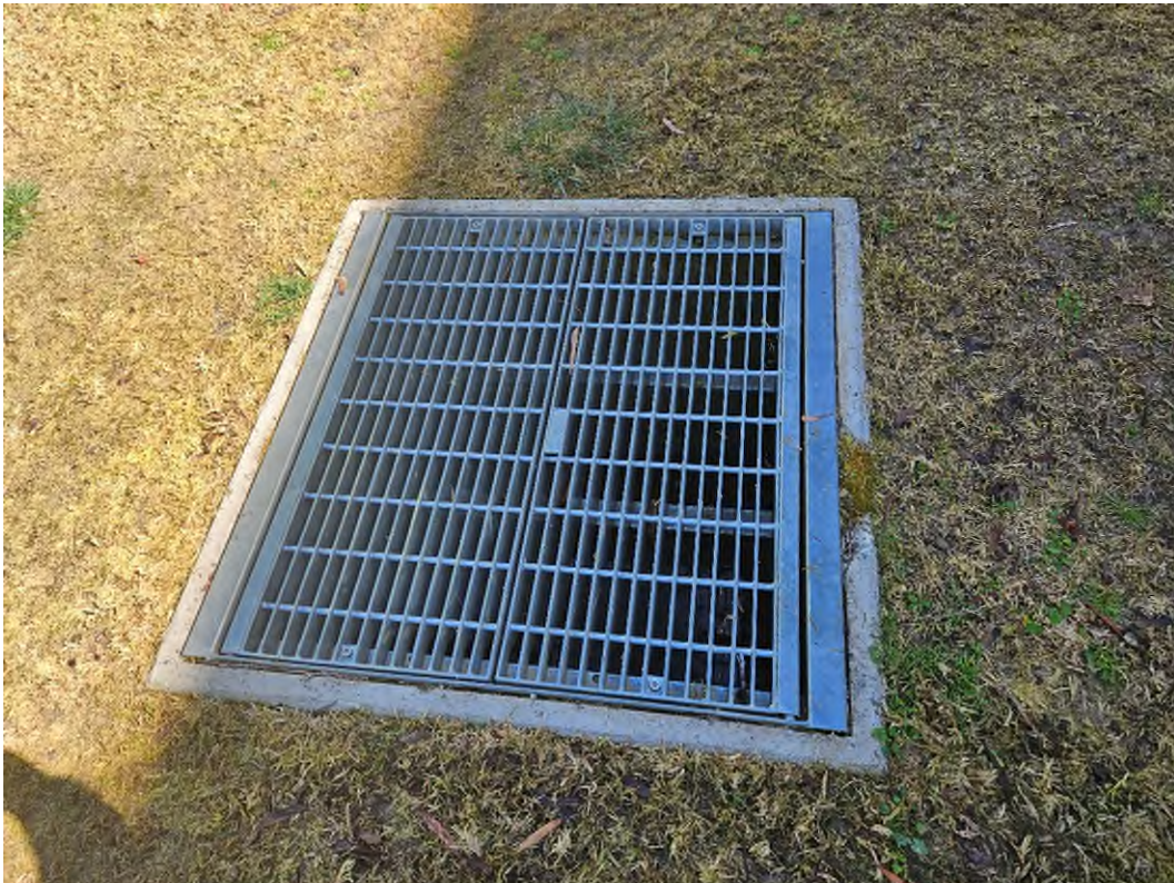
Figure 2: Stormwater Access

The access points are not considered to be a confined space because it is above ground and in an open area, but accessing for cleaning of blockages does expose the worker to the conditions within the stormwater system, which require confined space entry procedures to ensure worker safety.