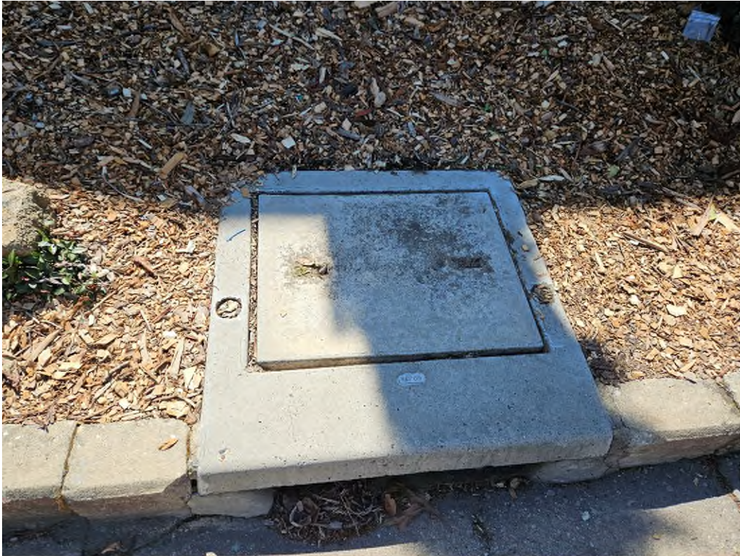
Figure 5: Stormwater Access