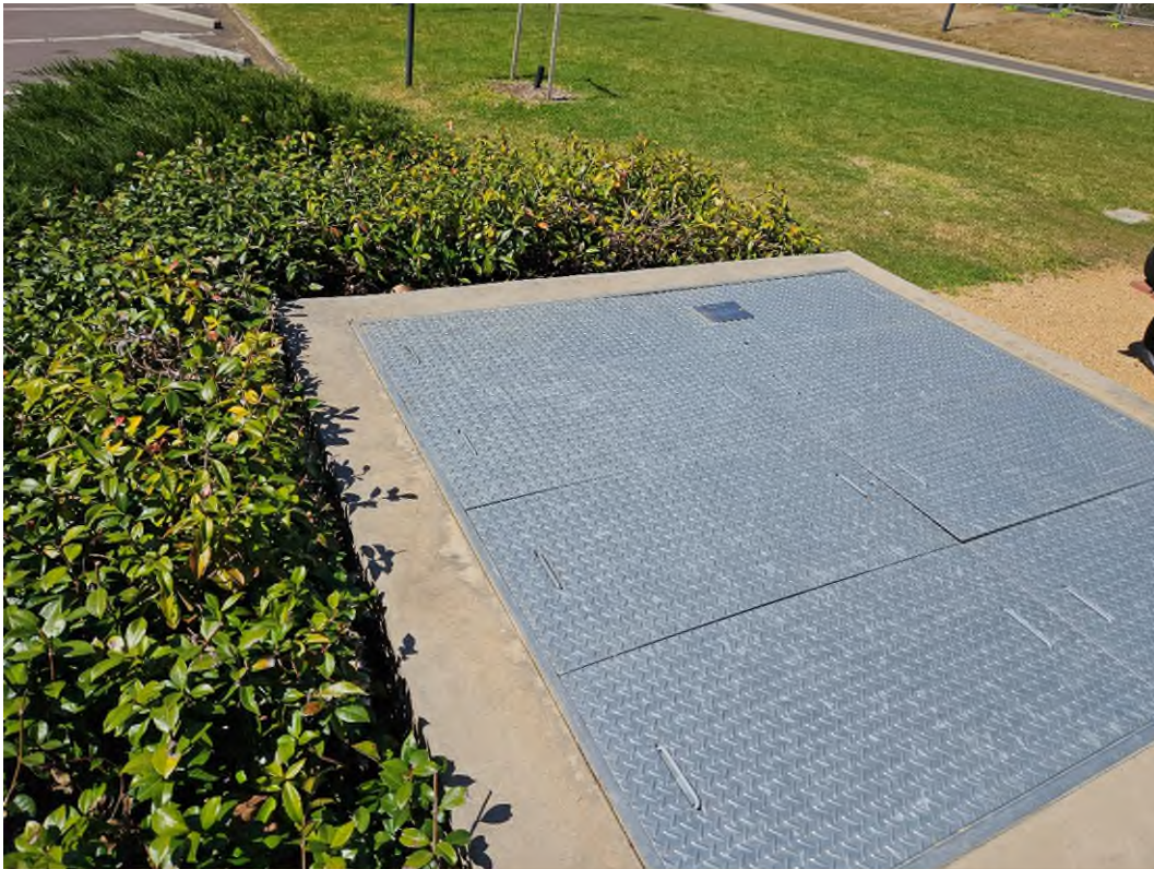
Figure 3: Stormwater access