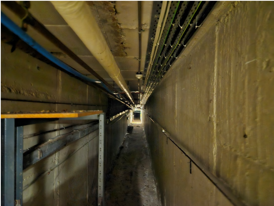
Figure 4: Tunnel