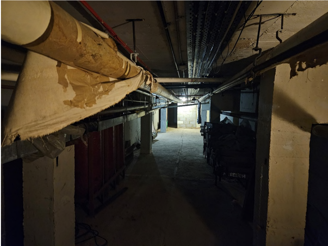
Figure 3: Tunnel with asbestos lagging