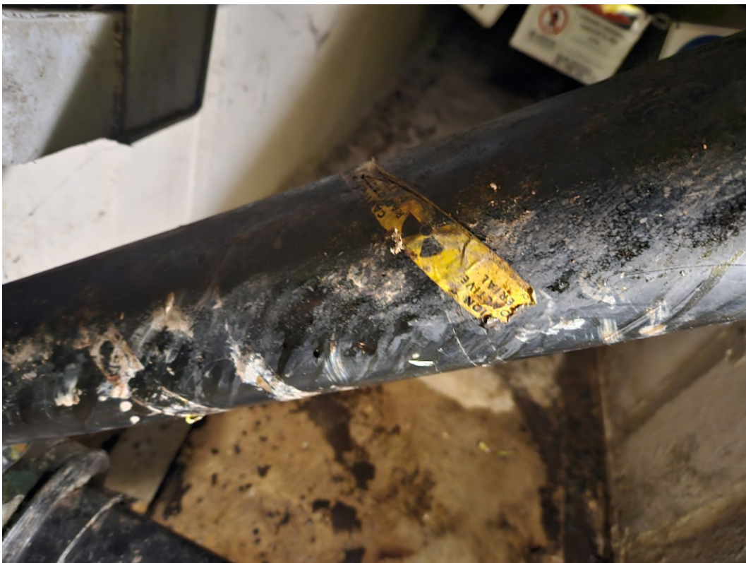
Figure 6: Radioactive water