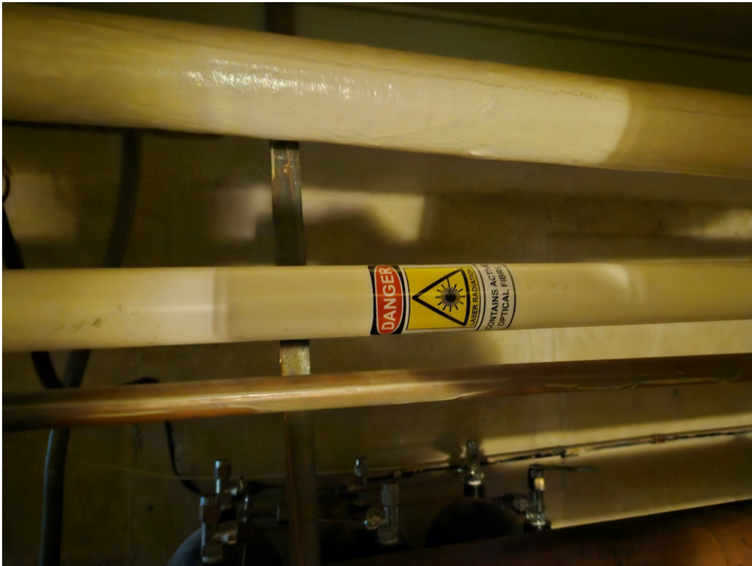
Figure 5: Hazardous gases and chemicals