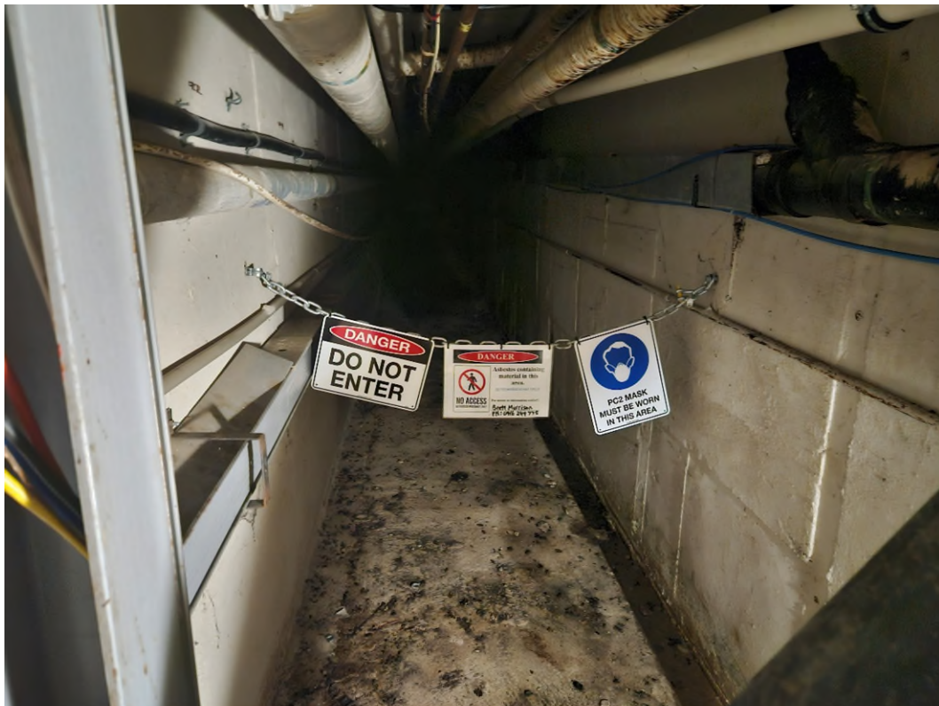
Figure 2: Tunnel

Due to the different types of services located in the tunnels; asbestos rope & lagging and sheeting, radioactive water and unknown gases, the tunnels should be considered to be a confined space. All access to the tunnels should be treated as a restricted area but under confined space conditions to ensure that workers safety in paramount.